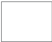
Fish Eagle White